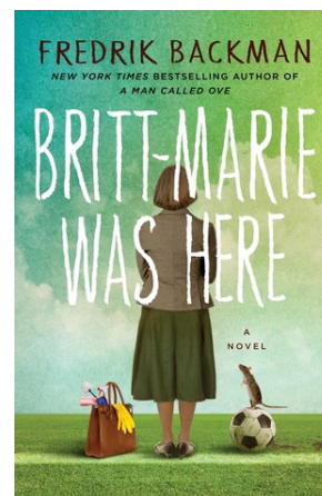
May book selection