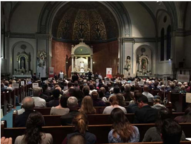
735 delegates strong!