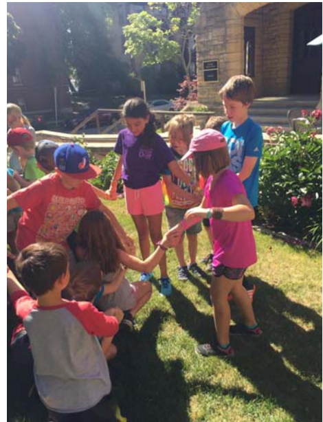
VBS with Lake Park Lutheran last summer