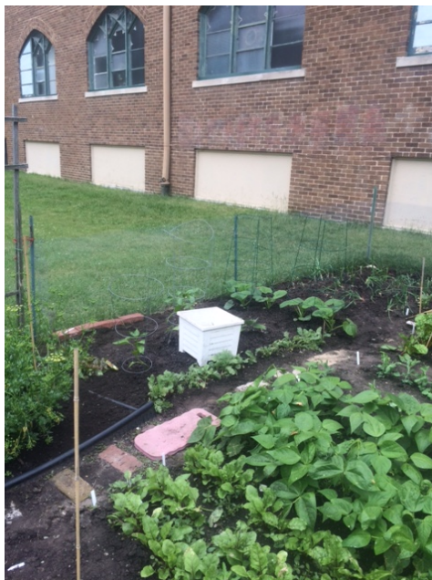
We're starting a tithing garden in our Community Garden.

Mass on the Grass: Weather permitting, our Wednesday 6p.m. Eucharist will move to the Green Space. Come for song, fellowship, prayer and some great snacks. It's a great opportunity for travelers or campers to stay connected to St. Mark's even when they're away for the weekend.