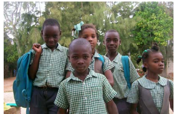
Students at St. Marc's School in Haiti