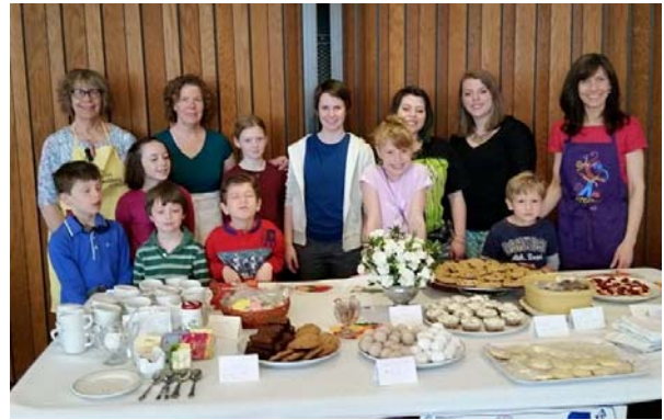
The Sunday School Bake Sale raised $347.51 for the Haiti Project.

Sunday School Recognition—June 7 Sunday School Picnic—June 14