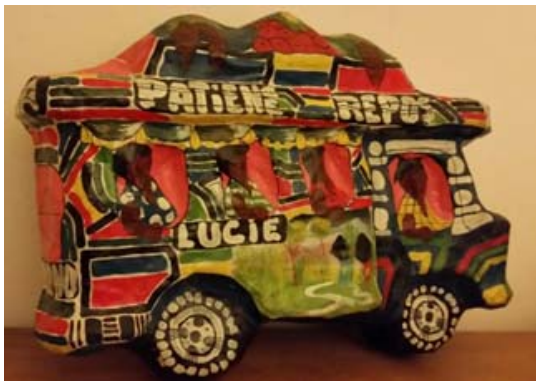
Paper mache model of a tap-tap —public transportation for people and market goods