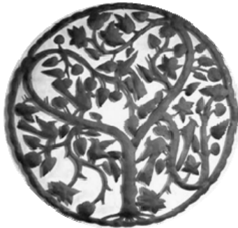
Tree of life motif in what's called fer forjé—metal cut and pounded from steel drums