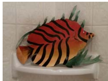
Fer forjé fish swims in a shower stall