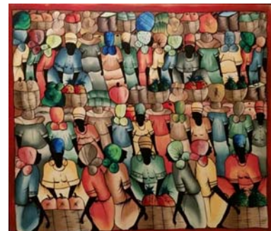
Contemporary painting of Haitian women at a market by an artist signed simply "John"